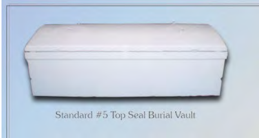
Standard #5 Top Seal Burial Vault

This is rebar re-enforced concrete, unlined $645.00 for most cemeteries. For any Forest Lawn cemetery, add $155.00 for additional personnel required by cemetery. For any service ending later than 2:30 PM add $75.00 per ½ hour for overtime