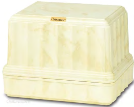
Universal Polystyrene Marbellon $595.00